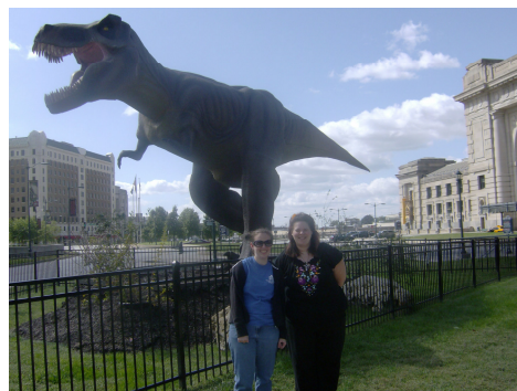
The view outside of our hotel in Kansas City, MO!

We participated in workshops entitled: Get the Power! Self-Advocacy is the Key to Independence; Reach for the Powerswitch; Tips on Activating the Self-Advocacy Movement; Finding the Heart, Courage, Knowledge, and Leadership in Self-Advocacy; Using Existing Tools to Increase Self-Advocacy Efforts; The Advanced Leadership Academy; Express Yourself; Yes! Training Delivery Style Effects Self-Advocacy Outcomes; and Beyond Tokenism: Serving on Boards & Policymaking Bodies.