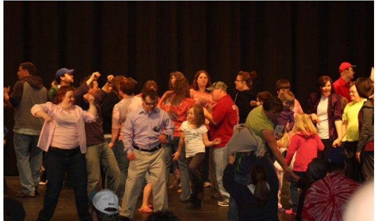
Dancing on stage after the event!