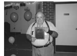
Clarence Mickelson Pioneer Award Goodhue County